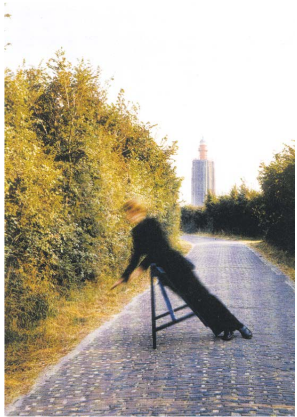
Bas Jan Ader, Broken Fall (Geometric; Blue-Yellow-Red) , Westkapelle, Holland, 1971, c-print, 15 3 / 4 x 10 3 / 4 ”.

For those seduced by the obsessive mystery of Bas Jan Ader comes the publication of In Search of the Miraculous: Bas Jan Ader Discovery File . Bound in black tape, like a photocopied college reader, this confounding volume reproduces the entire police report connected with the 1976 discovery (150 miles off the coast of Ireland) and almost immediate theft (from a Spanish port) of Ader’s boat, Ocean Wave . The contents of Ader’s wallet are here—including business cards, his UC Irvine faculty card, and scraps of classified ads—as are numerous legal documents concerning his disappearance, and maps diagramming the scene of the missing boat. Best perused like a crime novel, the file becomes yet another part of the ongoing work and enigma that was the life of Bas Jan Ader.