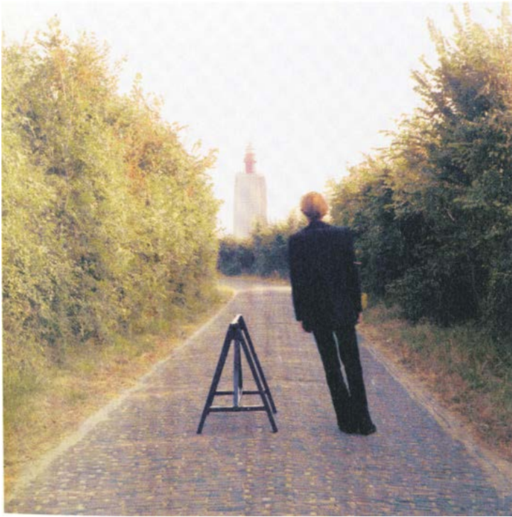
Bas Jan Ader, Broken Fall (Geometric; Blue-Yellow-Red) , Westkapelle, Holland, 1971, c-print, 10 3 / 4 x 11”.