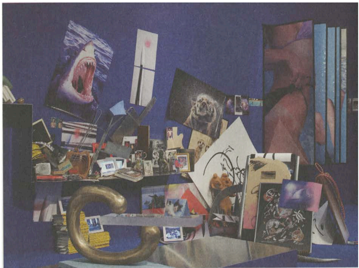
Above: Coupé/Décalé . 2010. 35mm film transferred on Betanum, 5 min. 20 sec.