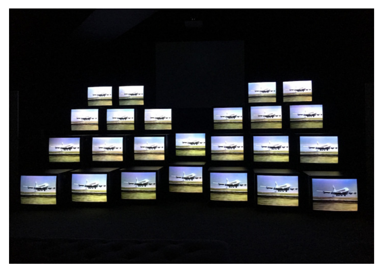
Gretchen Bender, "Total Recall" (still) (1987), 11-channel video installation on 24 monitors and 3 projection screens, 18.2 minutes, soundtrack by Stuart Argabright, dimensions variable

Gretchen Bender wanted to make a work of art that was so cutting edge that it told the future. It was the mid-1980s, and Bender's then-partner, Robert Longo, had recently shot to art-world stardom. Their apartment in Lower Manhattan was littered with state-of-the-art video equipment and stacks of Hollywood Reporter and Variety . The trade publications announced the titles of projects seeking financing or entering pre-production.