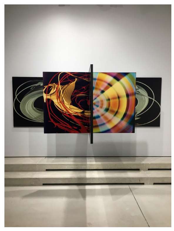
Gretchen Bender, "Untitled (Daydream Nation)" (1989), 12 laminated photographs, 40 × 120 × 60 1/2 inches

Tracking the Thrill effectively paved the way for So Much Deathless, currently on view at Red Bull Arts New York. Bender's first retrospective since 1991, it includes over 30 works created between 1982 and 2001. The show's overall scope, design, and ambition are extraordinary. It has been curatorially calibrated for maximum viewer engagement. Discreet touchscreens peppered throughout the show present concise oral histories by Denker, Longo, Vanderhyden, and many others. Burnished metal wall labels mirror the aesthetic of Bender's steel sculptures, their fonts sourced from the artist's exhibition materials.