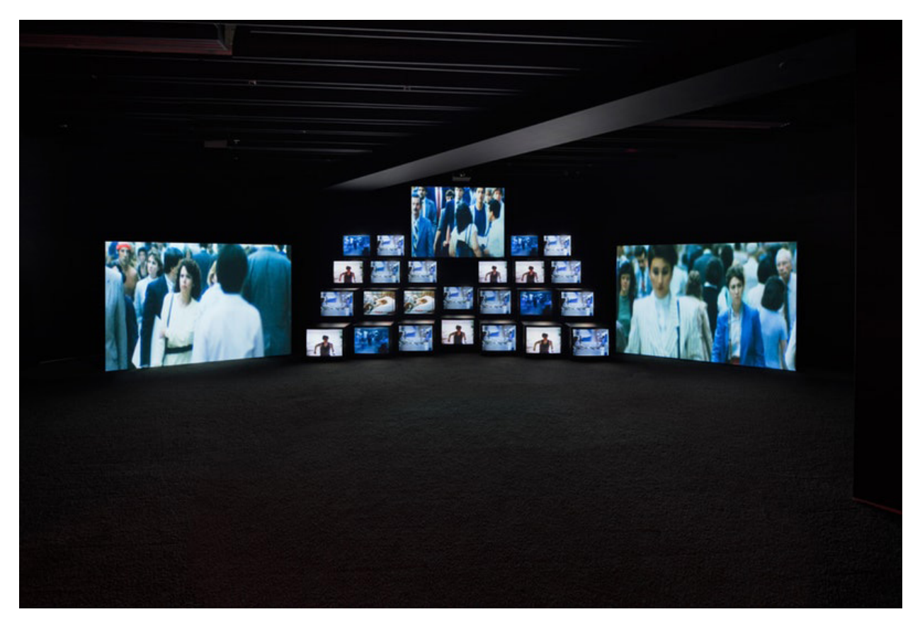
Gretchen Bender, Total Recall , 1987. 11-channel video installation on 24 monitors and 3 projection screens, 18.2 minutes, with soundtrack by Stuart Argabright.

In terms of sheer art world impact, Bender's biggest success was Total Recall , an 11-channel installation that she categorized as "video theater," and completed and shown in 1987. Arranging 24 monitors and three projection screens into a roughly pyramidal formation, the installation intentionally collapses the public space of the cinema and the intimate space of the living room into a shared observation zone, nudging the viewer to regularly adjust perspective and viewing distance while taking it in. Although the video content varies widely within the dense thicket of occasionally slow-motion images, by editing her 11 sources to synchronize the content across all the screens, and again commissioning the score from Argabright, Bender's result takes on the trappings of an 18-minute technological opera—its purely sensual impact lingering longer than the critical distance the artist invited us to maintain by noticing "the space in between" the images. At one point, Bender appropriates a scene from Salvador , Oliver Stone's 1986 film about the US-fueled civil war in El Salvador, that shows a photojournalist making his way through the aftermath of a massacre. But she has slowed down the action so that it starts to look as sentimentalized as the adjacent TV footage.