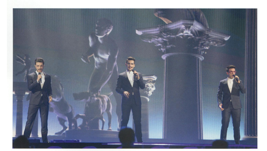
Italy participated in the Eurovision Song Contest 2015 with the song "Grande Amore," written by Ciro Esposito and Francesco Boccia. The song was performed by the male operatic pop trio Il Volo.