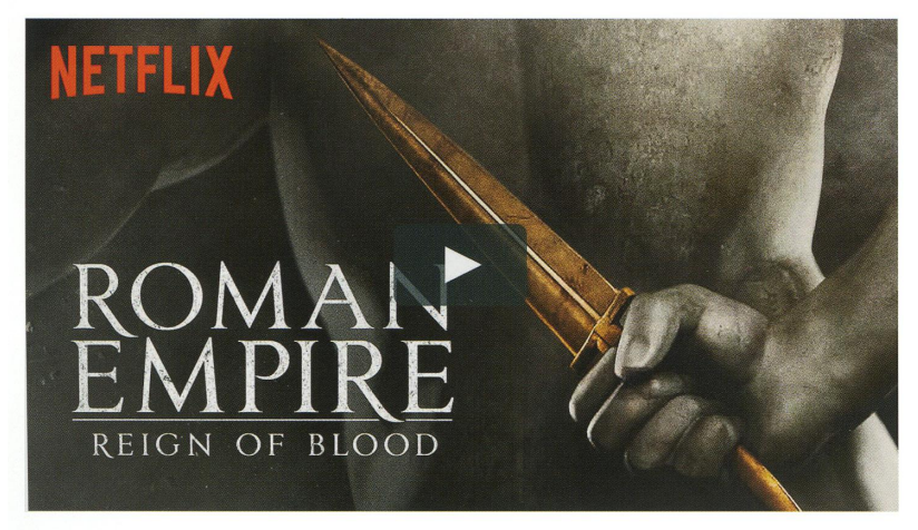
Opening titles from the Netflix series "Roman Empire" (2018).