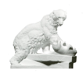
Polar Bear and Seal Artist: Otto Jarl Period: 1902 Material: Natural stone Location: Jörgerstraße 44 (Pezzlpark), 1170 Vienna Dimensions: 97 × 131 × 145 cm Scanned: 2016 Scanner: Mantis Vision F5-SR