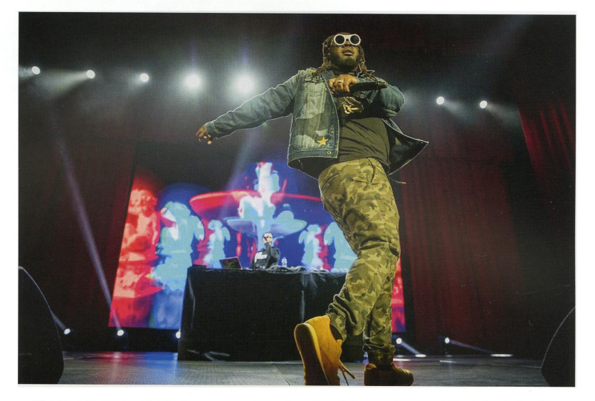
The American singer, songwriter, rapper, and record producer T-Pain performing at Clusterfest in San Francisco in 2018.