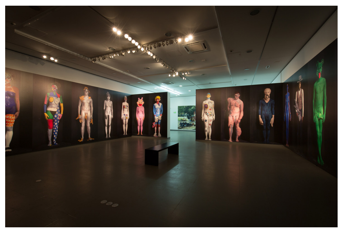
From the series Art Freaks. Installation view, 2016. NRW-Forum Düsseldorf, Germany

I am also working on a photograph that I'll take in the Swiss mountains, it's about global warming. I had to work with the idea of global warming and how to put that complex idea into a simple photo. I try to pick out scenes that are pertinent to today and include them in my work, and global warming is something that we have to deal with in the next decades, it's not something that will disappear.