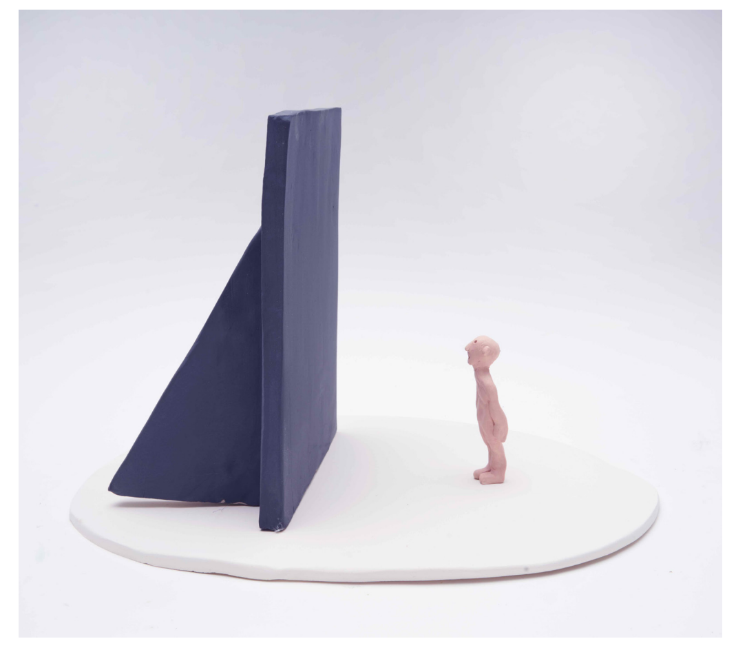
Olaf Breuning, The Wall, (2017) 3 ceramic sculptures 9.45 \times 13.78 \times 9.84 inches 24 \times 35 \times 25 cm

"I wish I could be a painter and I wish I could be a writer." Despite having worked with a plethora of mediums — including drawing, sculpture, photography, film and installation — during his 18-year long career, artist Olaf Breuning is still pining for more.