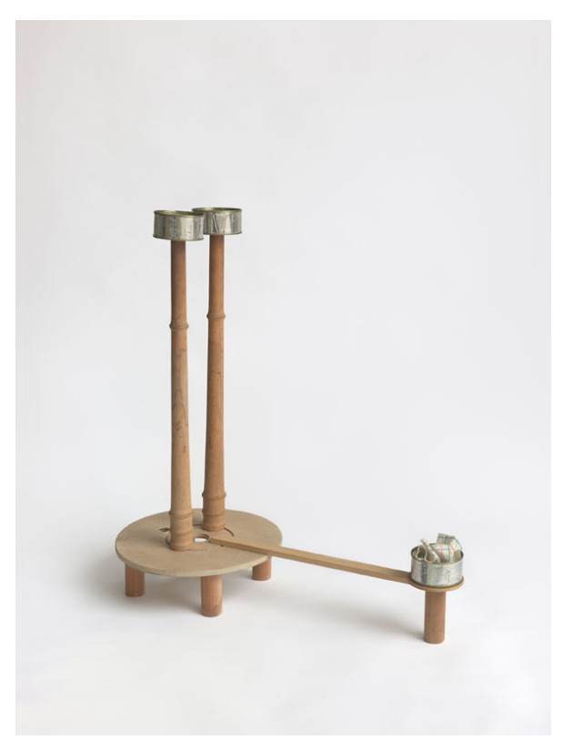
B. Wurtz, Untitled (cans with pier) , 1989. Wood, tin, cans, cloth. 261/4 \times 251/4 \times 12 inches.

Rail: Did that feel in conflict with your surroundings when you were studying at CalArts in the late '70s?