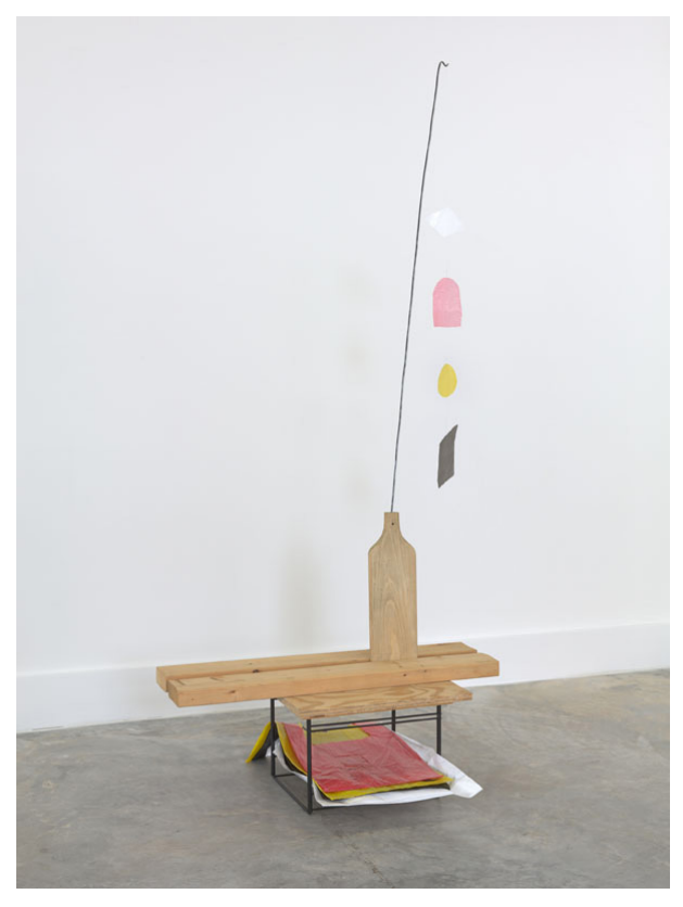
B. Wurtz, Untitled , 1997. Wood, wire, metal, plastic bags. 67 \times 30 \times 21 inches.

Rail: I recently re-read the Calvin Tomkins interviews with Duchamp and one thing that came up a lot and kept bringing me to your work is the importance of decision with the work—your gesture.