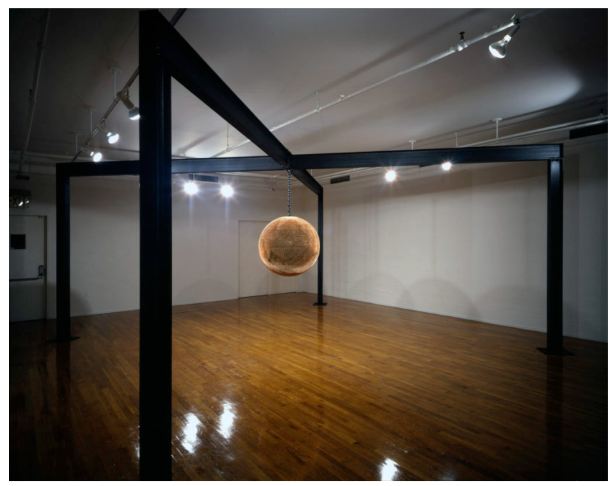
Robert Longo, Death Star (1993).