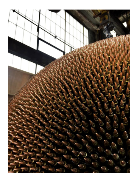
Robert Longo, detail of Death Star 2018.