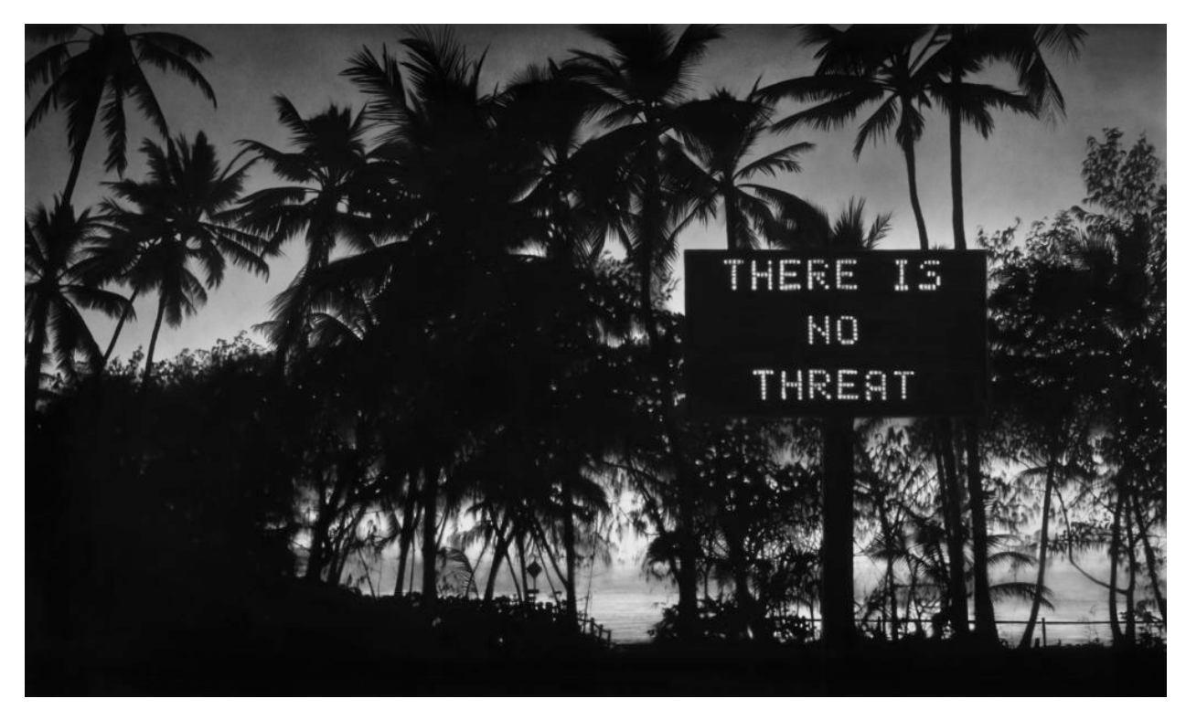
Robert Longo, Untitled (No Threat) (2018).