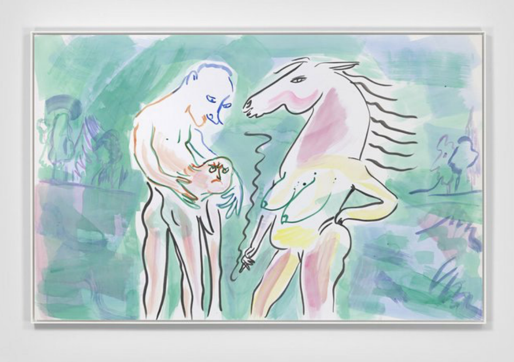
Camille Henrot, Single Parent, 2015