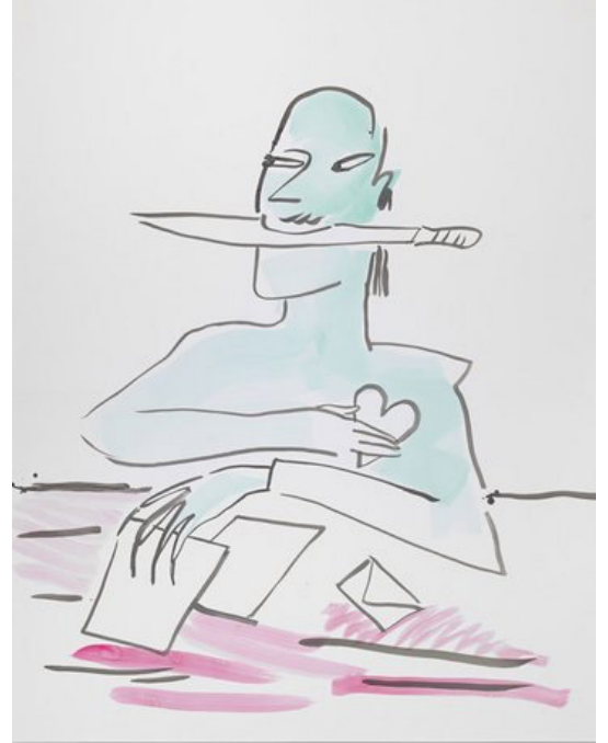
Camille Henrot, Splendid Isolation, 2015