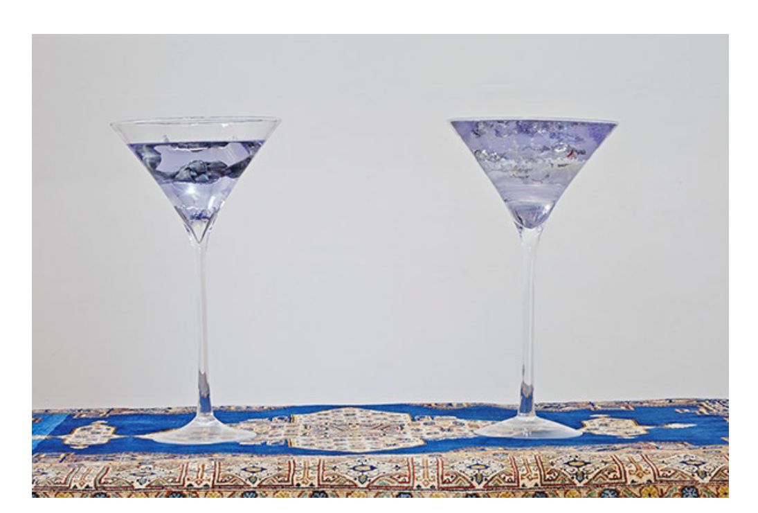
Stand, Formal Problem Business Plunge and Social Dependence Resource Plunge, 2014.