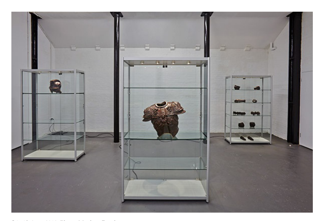
Liquid Assets, 2013.