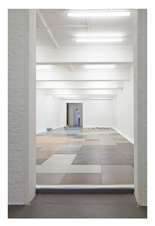
Industrial Revolution (detail), 2013. Photo: Matthew Booth