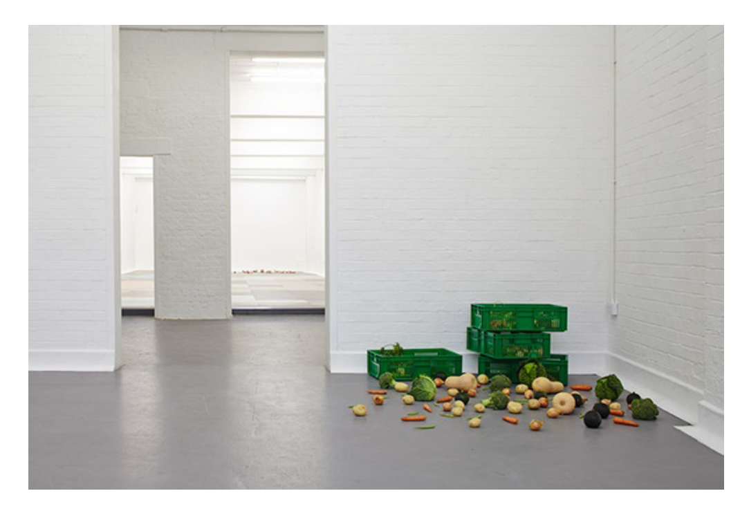
Scheme, 2014.