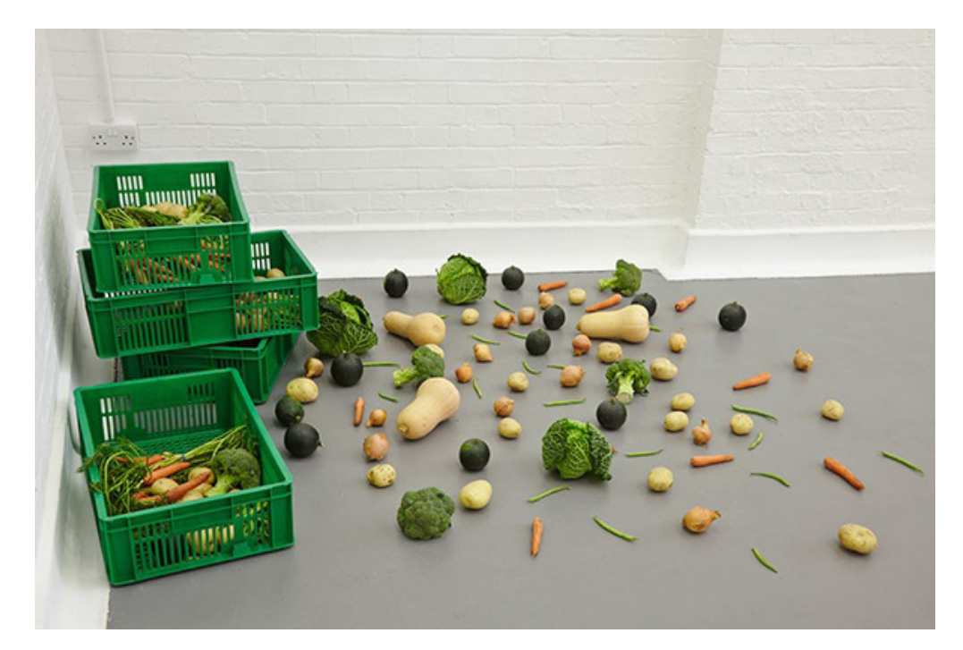
Scheme, 2014.