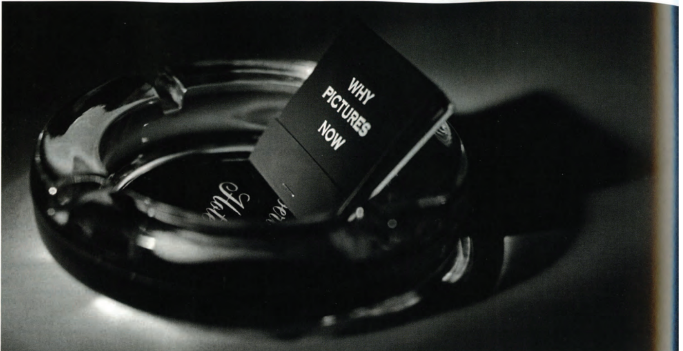
Louise Lawler, Why Pictures Now , 1981, gelatin silver print, 3 x 6".

Crimp, Douglas. "Close-Up: Indirect Answers - Douglas Crimp on Louise Lawler's Why Pictures Now , 1981," ARTFORUM (Vol. 51, Issue 1, September 2012): 502-505.