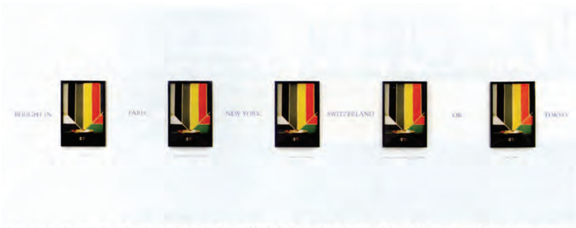
Louise Lawler, Bought in Paris, New York, Switzerland or Tokyo, 1987 Stella/Brass, (detail) Les Indes Galantes IV, . . . purchased from a banker, now located on the Blv. Victor Hugo, 1966–86, five Cibachromes, wall text, 2' 4½" x 23' 7".

situation in the interview I conducted with her for An Arrangement of Pictures :